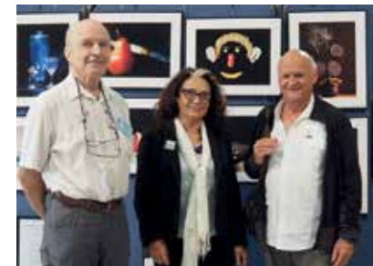
Photo exhibitions in support of the NGO's activities were organised by Fotovar and PhotoMenton. They were a big success, attracting several thousand visitors.

HAMAP-Humanitaire took part in the Salon des Maires exhibition on 24, 25 and 26 November 2019 and helped launch the "Water is a right" campaign in partnership With the 30 NGOs of the Water Coalition.